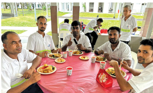
Page 5 Chinese New Year Cleaners' Appreciation

Check out our CNY celebrations across town on page 4