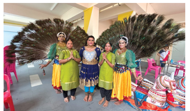
Page 11 Pongal Celebrations in Sembawang GRC