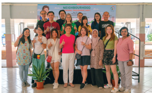
Page 9 Public Consultation & Exhibition @ Sembawang West